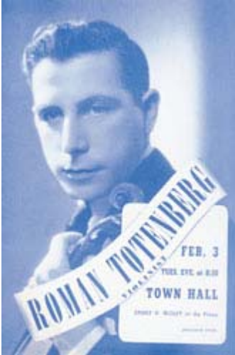
Program for a Town Hall concert in New York, circa 1937 — ticket prices began at $.83.